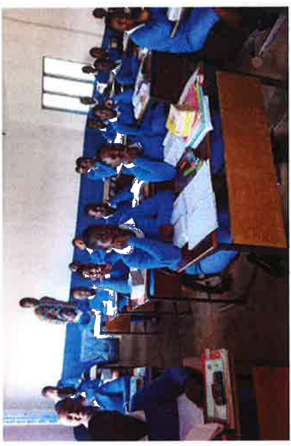
1) Above: Classrooms completed in Rainbow College