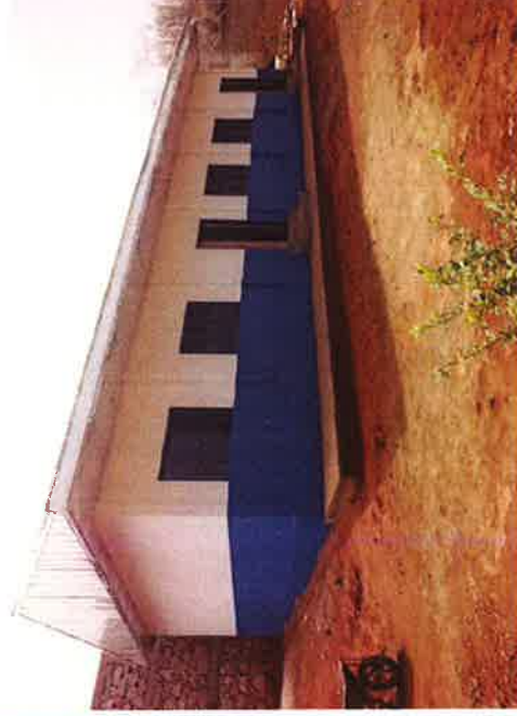
The Director of CIC discusses the progress of work with school CEO. Completed classrooms