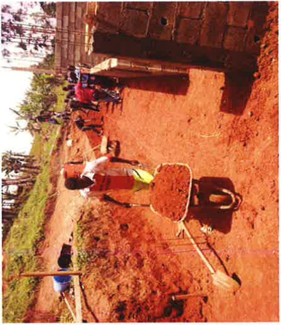
Construction of 2 classrooms in GHS Litieu – Frontline staff joins the community in digging and leveling of the yard