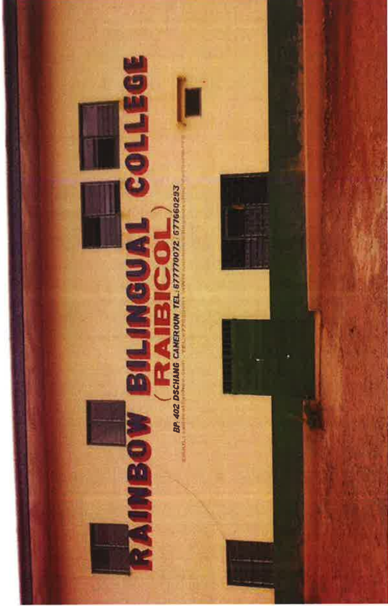
Rainbow Binigual College, Dschang