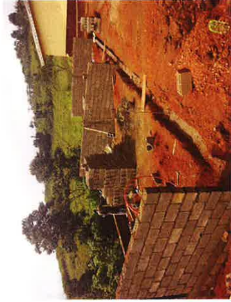
2) Below: Classrooms under construction in GHS Litieu