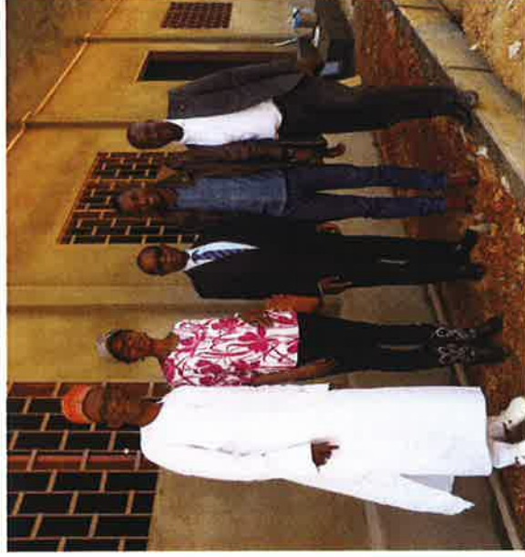
Rainbow College – Roofing of 2 classrooms. The Director of CIC and delegation visiting the project