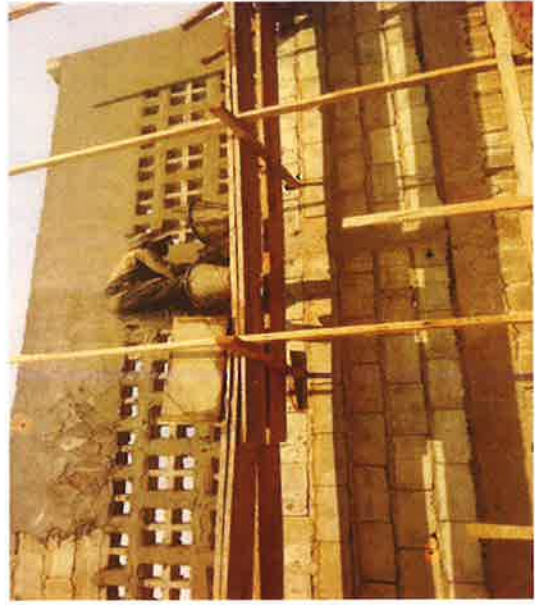
Construction of 2 classrooms in GHS Litieu – Completion of the walls and plastering