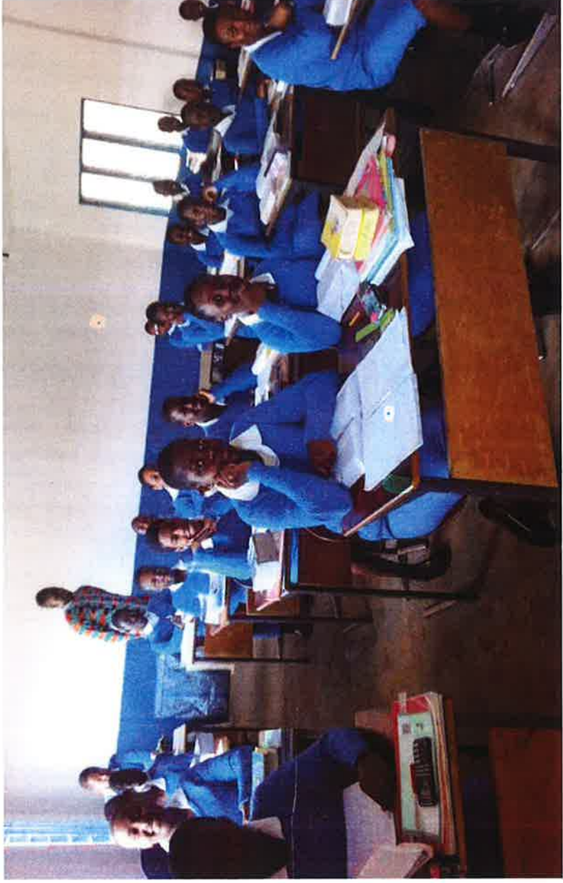
Students using the newly constructed classrooms in Rainbow College