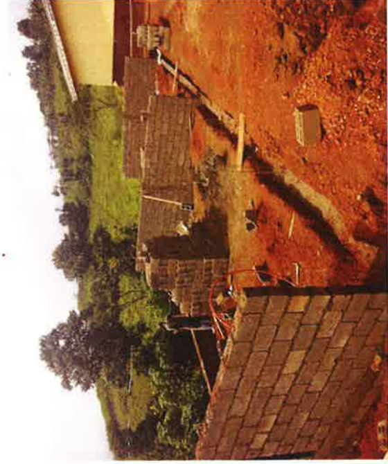
Construction of 2 classrooms in GHS Litieu – Raising of the walls