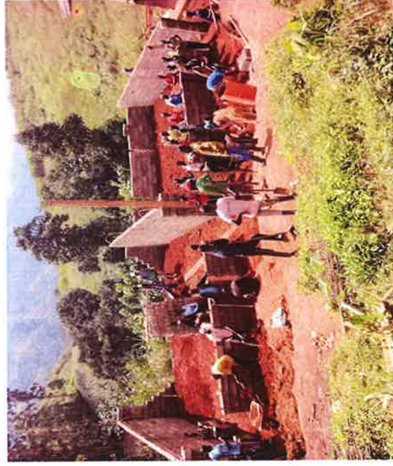
Construction of 2 classrooms in GHS Litieu – Community participation in filling of the foundation and leveling of the yard