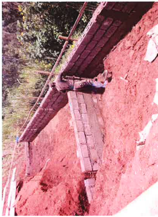
Foundation for 2 classrooms in GHS Litieu