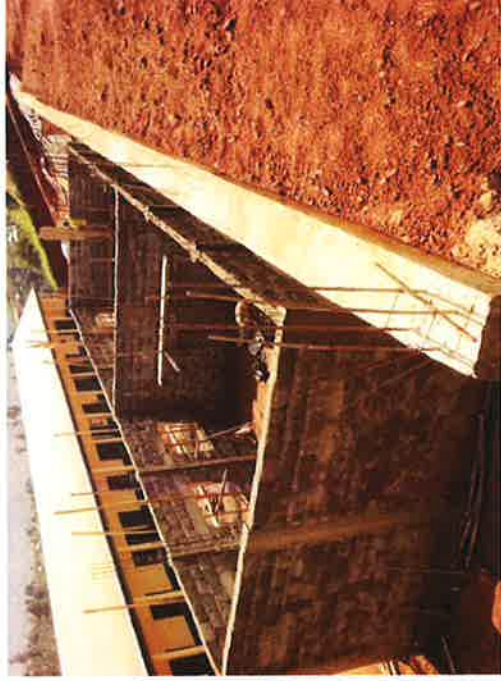
Construction of 2 classrooms in Rainbow College – Raising of walls